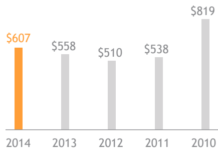
Cash Flow Generation 2010-2014 (in millions)

Note: Primarily consists of gross dividends received from subsidiaries, less interest and other corporate expenses. Excludes proceeds from 2013 debt issuance.