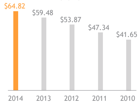
Book Value Per Diluted Share 2010-2014

Note: Excluding AOCI. Please see footnote 3 on page 8 for a reconciliation of this non-GAAP financial measure to its most comparable GAAP measure.